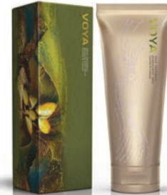
TRUE TRANQUIL RELAXING SHOWER WASH 200ml

70% certified organic ingredients This lavender and rosemary body wash is infused with natural purifying properties of wild Irish seaweed. This mild yet effective organic foam body wash contains essential oils and naturally derived cleansing and conditioning agents to help soften and leave your skin feeling nourished and you more relaxed.