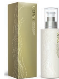
CLEANSE AND MEND FACIAL CLEANSING MILK

VOYA's advanced facial skincare range for sensitive and normal skin combines the restorative properties of seaweed with carefully selected natural active ingredients to help calm, soothe and desensitise reactive skin. By its very nature, seaweed is suitable for the treatment of sensitive skin and skin conditions such as rosacea and psoriasis, as it naturally soothes and heals. Fucus serratus seaweed extract is rich in anti-inflammatory properties and is used throughout this range to gently rejuvenate and nourish. This is superior organic skincare for sensitive skin.