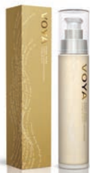
EVEN PURE LIGHT CALMING MOISTURISER 50ml

90% certified organic ingredients This antibacterial gel toner will help reduce excess sebum, minimise pores and balance the pH of the skin; leaving your skin looking cool, calm and refreshingly matt.