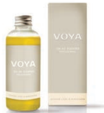
GINGER CHAI & MANDARIN DIFFUSER REFILL 100ml

VOYA's room diffuser refills allow you to enjoy your favourite VOYA scent for longer. These are available in VOYA's four therapeutic signature scents. Reeds are not sold with these products these must be kept from your original diffuser purchase.