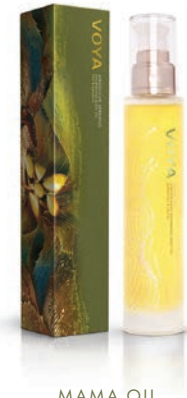
MAMA OIL STRETCH MARK MINIMISING BODY OIL 100ml

VOYA's stretch mark minimising body cream contains the antioxidant properties of fucus serratus seaweed combined with shea butter and coconut oil to deeply moisturise and nourish the skin with essential fatty acids. Golden seaweed and manilkara tree complexes will assist in promoting the development of collagen and elastin, helping to strengthen the skin and minimise stretch marks. This unique blend of organic ingredients, will over time help to reduce the appearance of red stretch marks, leaving the skin smoothed and plumped. Suitable during and post pregnancy.