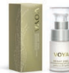
BRIGHT EYES REGENERATING EYE CRÈME 15ml

87% certified organic ingredients This is the perfect tonic for sensitive skin. Containing seaweed and pro-collagen, this amazing mask will calm irritations, moisturise, firm and tone, leaving the skin feeling refreshed and rejuvenated. Expert Tip: can be used to help heal shaving rash, burns, and grazes.