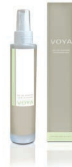
AFRICAN LIME & CLOVE LUXURY ROOM SPRAY 100ml

VOYA's original scent of citrus and the sea. A refreshing vibrant aroma with top citrus notes of lemon, grapefruit and fresh lime combined with an unexpected twist of crisp herbs and warm spicy clove. These handy sprays are 100% natural and made with pure essential oils and only natural emulsifiers; they are full of tiny droplets of aromatherapy goodness -- no chemicals included.