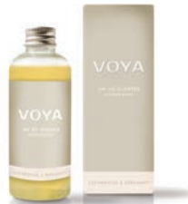
CEDARWOOD & BERGAMOT DIFFUSER REFILL 100ml