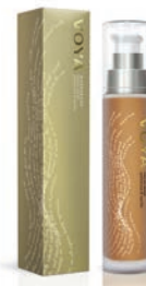
MASKERADE FACIAL MASK 50ml

89% certified organic ingredients VOYA's Palmarosa Balm is a luxurious blend of power packed seaweed and nourishing oils. Made with sea heather to reduce sensitivity and inflammation, it leaves your skin feeling soothed, comforted and calm. Our advanced formula will strengthen your skin giving long lasting protection from the environment.