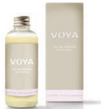
LAVENDER ROSE & CAMOMILE DIFFUSER REFILL 100ml