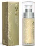
PALMAROSA BALM FACIAL SERUM 30ml

89% certified organic ingredients VOYA's Visage ultra-soothing eye mask is a beautiful tonic for even the most sensitive of eyes. The sea heather within will strengthen, protect and reduce inflammation, while the green tea desensitises, cools and calms. ideal for tired eyes that need a lift.