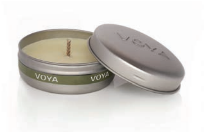
THE ORIGINAL TRAVEL CANDLE