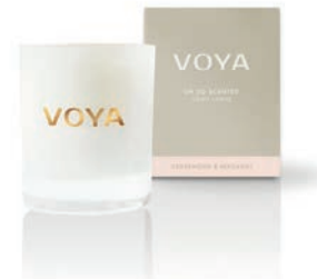
CEDARWOOD & BERGAMOT LUXURY CANDLE 20cl

Be enchanted by invigorating eucalyptus, blended with compelling citrus and deep forest wood scents. This fragrance is timeless, refined and luxurious. Sweet bergamot mixed with luscious cedarwood and rosewood creates a sumptuous yet clean and balanced aroma. This uplifting fragrance will effortlessly transform your surroundings with opulence. These natural blended candles burn cleanly and up to 30 hours. The wax is created with pure, natural soybean oil and rapeseed. All ingredients are composed of non-petroleum renewable resources, promoting the growth and care of our environment while burning crisp and clean with a gentle natural glow.