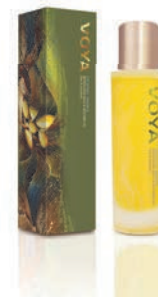
ORIGINAL AROMA REVITALISING BATH AND SHOWER OIL 50ml