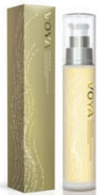
RADIANCE ILLUMINATING EXFOLIATING GEL 50ml

87% certified organic ingredients VOYA's Radiance naturally active seaweed enzyme exfoliator gently dissolves dead skin cells, leaving your skin silky smooth and glowing with radiance. Expert Tip: Leave for 5-10 minutes then wipe away with a VOYA's muslin cloth for added exfoliation.