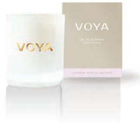
LAVENDER ROSE & CAMOMILE LUXURY CANDLE 20cl

VOYA's original scent of citrus and the sea. A refreshing vibrant aroma with top citrus notes of lemon, grapefruit and fresh lime combined with an unexpected twist of crisp herbs and warm spicy clove. These natural blended candles burn cleanly and up to 30 hours. The wax is created with pure, natural soybean oil and rapeseed. All ingredients are composed of non-petroleum renewable resources, promoting the growth and care of our environment while burning crisp and clean with a gentle natural glow.