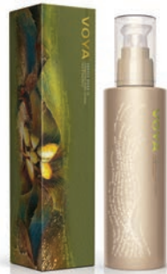
SOFTLY DOES IT HYDRATING BODY LOTION 200ml

70% certified organic ingredients Awaken the body and mind with an intense infusion of zesty lime and rejuvenating mandarin essential oils, blended with seaweed to accelerate healing of damaged tissues. The active seaweed extracts help to relieve muscle stress and fatigue.