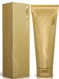
CAST AWAY CLEANSING FACIAL WASH 125ml

89% certified organic ingredients Our gentle facial wash will remove light make-up, eliminate impurities and enhance your skin's natural balance; leaving your skin feeling silky soft, ocean fresh and deeply cleansed.