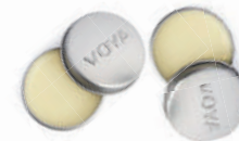
BALMELICIOUS LIP BALMS 15ml

82% contains organic ingredients Our award-winning super soft antioxidant rich eye crème has an exciting range of functional organic ingredients and seaweed extracts which help to fight off ageing, giving a youthful appearance to tired eyes.