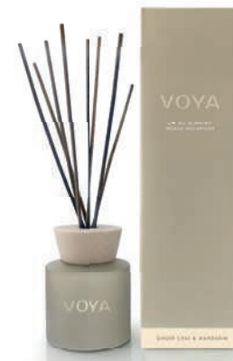
GINGER CHAI & MANDARIN OH SO SCENTED REED DIFFUSER 100ml

This soothing fragrance will help to de-stress and settle a racing mind