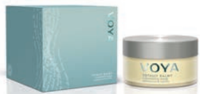
TOTALLY BALMY CLEANSING FACIAL BALM 100ml