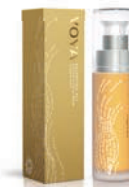
BALANCING ACT SMOOTHING FACIAL SERUM 30ml

89% certified organic ingredients Using pineapple and seaweed enzymes, this active exfoliating mask will give the duller skin a new lease of life. It will gently eliminate dead skin cells whilst helping to minimise visibility of pores, leaving the skin fresh, radiant and smooth.