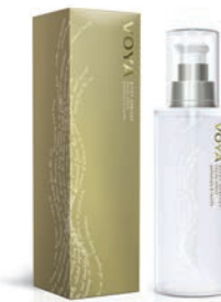
RITZY SPRITZY FACIAL SPRITZ TONER

Expert Tip: great to use as an eye make-up remover.