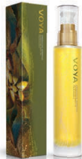
ANGELICUS SERRATUS NOURISHING BODY OIL 100ml

80.30% certified organic ingredients A distinctly fragrant nourishing body moisturiser with notes of citrus and the sea. Blended with hand-harvested organic seaweed, anti-ageing prickly pear oil, super-softening plum oil and poppy seed to intensely soothe and moisturise skin, improving suppleness and elasticity.