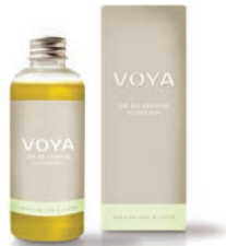
AFRICAN LIME & CLOVE DIFFUSER REFILL 100ml