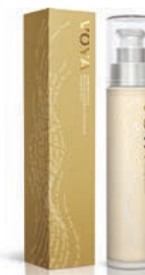
LUMINOSITY REFINING RADIANCE EXFOLIATOR 50ml

Expert Tip: to banish unwanted blemishes, apply a small amount to blemish and leave on skin overnight.