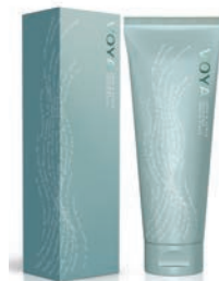
LOVE A SCRUB FACIAL SCRUB 125ml

Expert Tip: apply a thin layer before you go to bed and sleep in the mask overnight.