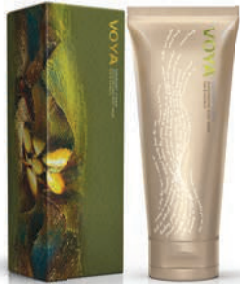
SQUEAKY CLEAN INVIGORATING BODY WASH 200ml

70% certified organic ingredients Awaken the body and mind with an intense infusion of zesty lime and rejuvenating mandarin essential oils, blended with seaweed to accelerate healing of damaged tissues. The active seaweed extracts help to relieve muscle stress and fatigue.