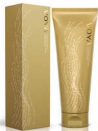
POREFLECTION CLARIFYING GEL TONER 125ml

Expert Tip: can be used as a shaving gel.