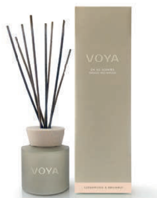
CEDARWOOD & BERGAMOT OH SO SCENTED REED DIFFUSER 100ml

This scent has a bright and sunny nature which provides an uplifting and refreshing pick me up to awaken the senses, boost your mood and help you enjoy your day.