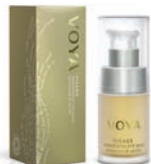
VISAGE AWAKENING EYE MASK 15ml

87% certified organic ingredients VOYA's Radiance naturally active seaweed enzyme exfoliator gently dissolves dead skin cells, leaving your skin silky smooth and glowing with radiance. Expert Tip: Leave for 5-10 minutes then wipe away with a VOYA's muslin cloth for added exfoliation.