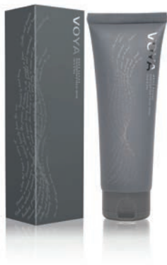
MENS' RANGE INVIGORATING FACIAL WASH 125ml

Our certified organic cooling shave gel offers the ideal medium for a close shave whilst protecting the most sensitive of skins. This refreshing gel formulation combines Sea Heather and natural seaweed extract to hydrate and soothe any shaving irritations, while vibrant fragrances of rosewood, lime and clove lead to a citrus cool shaving experience. This result driven shave gel works hard to naturally protect, soften and deeply hydrate the skin.