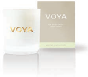
AFRICAN LIME & CLOVE LUXURY CANDLE 20cl

VOYA's original scent of citrus and the sea. A refreshing vibrant aroma with top citrus notes of lemon, grapefruit and fresh lime combined with an unexpected twist of crisp herbs and warm spicy clove. These natural blended candles burn cleanly and up to 30 hours. The wax is created with pure, natural soybean oil and rapeseed. All ingredients are composed of non-petroleum renewable resources, promoting the growth and care of our environment while burning crisp and clean with a gentle natural glow.