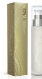
ME TIME SOOTHING MOISTURISER

Our facial toner gently helps to tone, cool and hydrate your skin. This luxurious toner can be used all day as a refresher on flights or to cool and soothe at the beach.