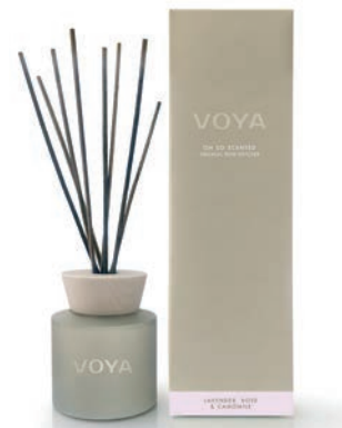
LAVENDER ROSE & CAMOMILE OH SO SCENTED REED DIFFUSER 100ml

Sensuous, calming, subtle and sweet, this scent evokes instant tranquility and a sense of relaxation, created by cushioning notes of camomile with rose essence. Experience the gentle floral uplift of summery lavender and geranium and let it unfold like a bouquet of freshly cut flowers, enveloping your chosen environment with a harmonious soothing aroma. Calming rose and elegant camomile combine to make this therapeutic scent the ultimate accomplice to the perfect night's sleep.