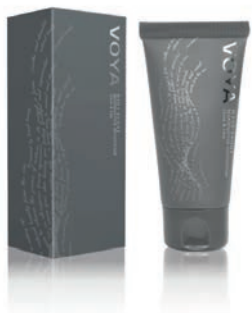
MEN'S RANGE REJUVENATING MOISTURISER 50ml