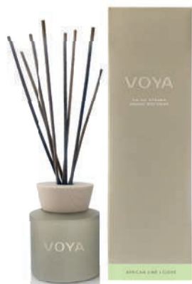
AFRICAN LIME & CLOVE OH SO SCENTED REED DIFFUSER 100ml

If you loved our original Lime and Basil Diffuser this is the one for you! Feel instantly tantalised, refreshed and revitalised by African lime, lemon and clove fragrance. This is a sparkling vibrant aroma with top citrus notes of lemon, grapefruit and fresh lime combined with an unexpected twist of crisp herbs and warm spicy cloves; perfected with a hint of patchouli.