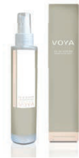
LAVENDER ROSE & CAMOMILE LUXURY ROOM SPRAY 100ml

VOYA's original scent of citrus and the sea. A refreshing vibrant aroma with top citrus notes of lemon, grapefruit and fresh lime combined with an unexpected twist of crisp herbs and warm spicy clove. These handy sprays are 100% natural and made with pure essential oils and only natural emulsifiers; they are full of tiny droplets of aromatherapy goodness -- no chemicals included.