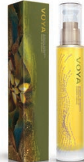
MINDFUL DREAMS RELAXING BODY OIL 100ml

70% certified organic ingredients This lavender and rosemary body wash is infused with natural purifying properties of wild Irish seaweed. This mild yet effective organic foam body wash contains essential oils and naturally derived cleansing and conditioning agents to help soften and leave your skin feeling nourished and you more relaxed.