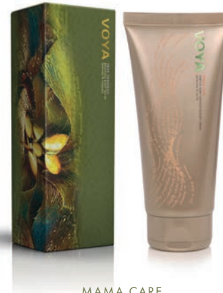
MAMA CARE STRETCH MARK MINIMISING BODY CREAM 200ml